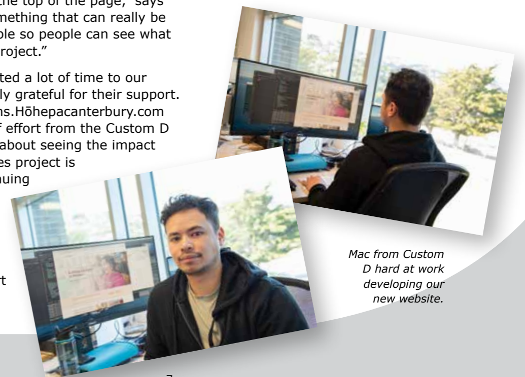
Mac from Custom D hard at work developing our new website.