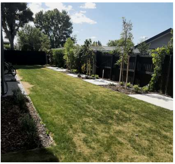
The brand new Hapori apartments.